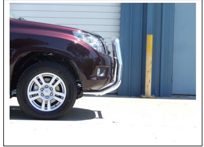
Figure 6: Side view, Series 2 Nudge Bar.