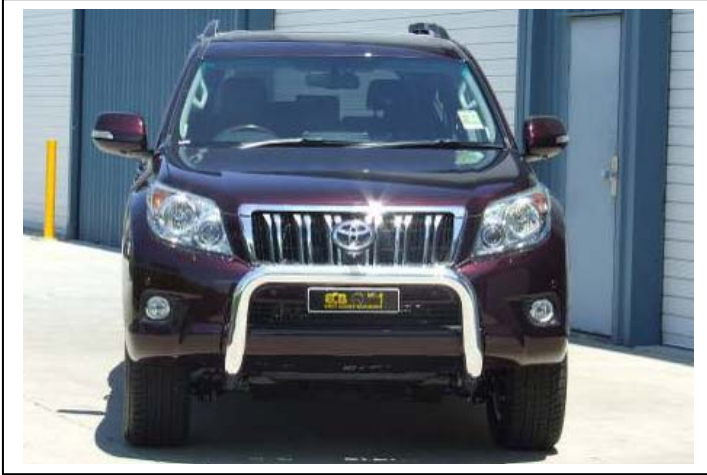
Figure 5: Front view, 76mm Nudge Bar