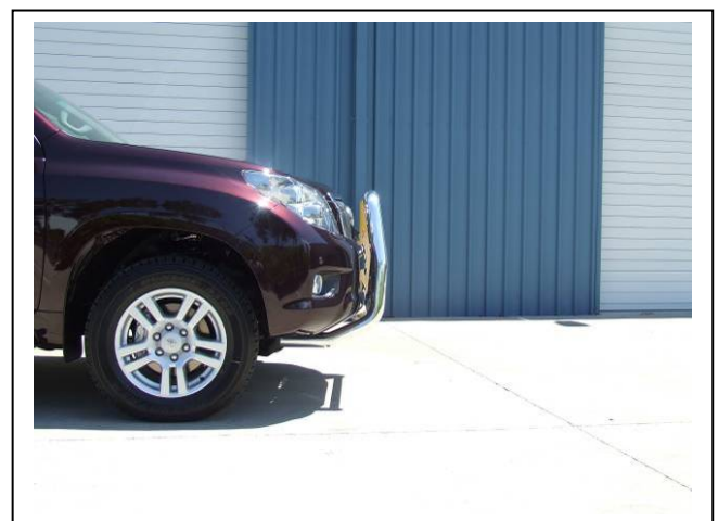
Figure 4: Side view 76mm Nudge Bar.