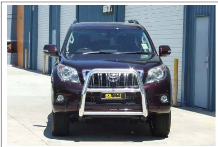
Figure 7: Front View, Series 2 Nudge Bar