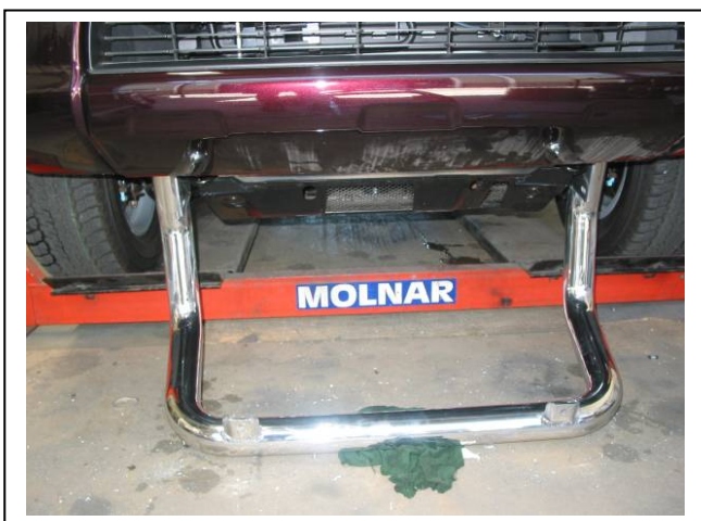
Figure 3: Protection bar positioned ready for fitment.